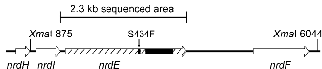
FIG. 1. Restriction map of the nrd locus of C. ammoniagenes strains ATCC 6872 (24, 40) and CH31 (7). The arrow indicates the point mutation within the nrdE gene. The position of the nrdE hybridization probe is shown as a black bar.